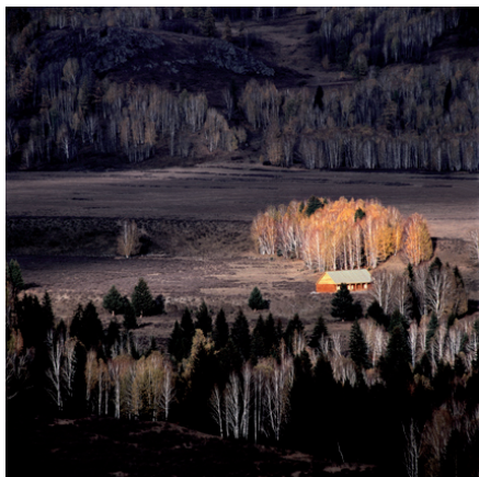
Master 2009, Landscape Bang Peng, Hong Kong

If you need the images in high resolution, please, contact us at any time.