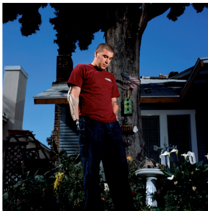
Master 2009, Editorial Nina Berman, NYC, USA